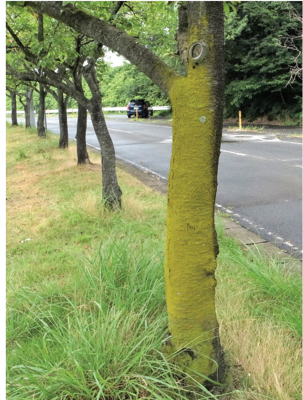
Fig. 1. The habitat of Candelariella xanthostigmoides (yellow patches) on bark of Tsuga diversifolia trees in Shiojiri-city (Japan).

Specimens examined: “Japan, Honshu, Prov. Shinano (Pref. Nagano), Mt. Kirito, Shiojiri-city, elev. 900–1100 m, on bark of Tsuga diversifolia , 29 V 1987. H. Kashiwadani et al. 34477” (TNS).