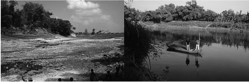
Fig. 1. The Sambungmacan canal site (left) and the discovery site of Sm 3 and 4 (right).