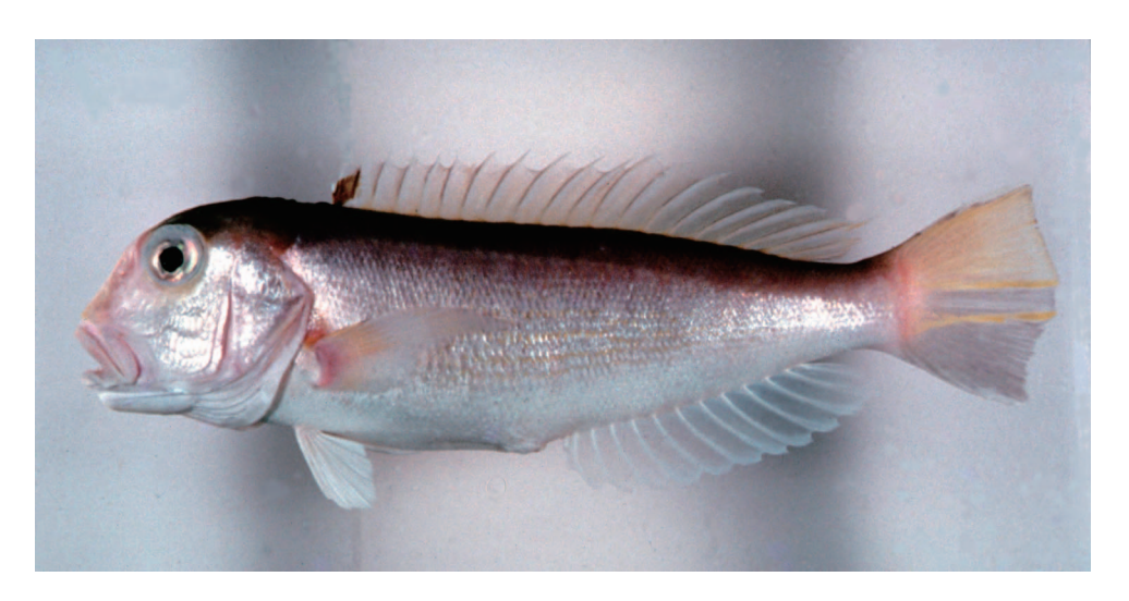
Fig. 1. Photograph of Branchiostegus okinawaensis sp. nov. URM-P 593, holotype. 286.4 mm SL, Naha, Okinawa Island, Japan.

Diagnosis. A species of Branchiostegus is distinguished from other species in the genus by having the following characters: 5–6 diagonal scale rows on cheek with 2 enlarged scales in the middle of row, its maximum diameter 2.2–3.0 in OD; scales on cheek not covered with skin; HL 3.0–3.3 in SL; first dorsal-fin spine 1.7–2.3 in OD; second dorsal-fin spine 0.9–1.3 in OD; second pelvic-fin soft ray longest; pelvic fin length shorter than the longest dorsal-fin soft ray (13th); longitudinal lateral line scales 75–86; silvery cheek; a rectangular, dusky-yellow blotch on the fin membrane between first and third dorsal