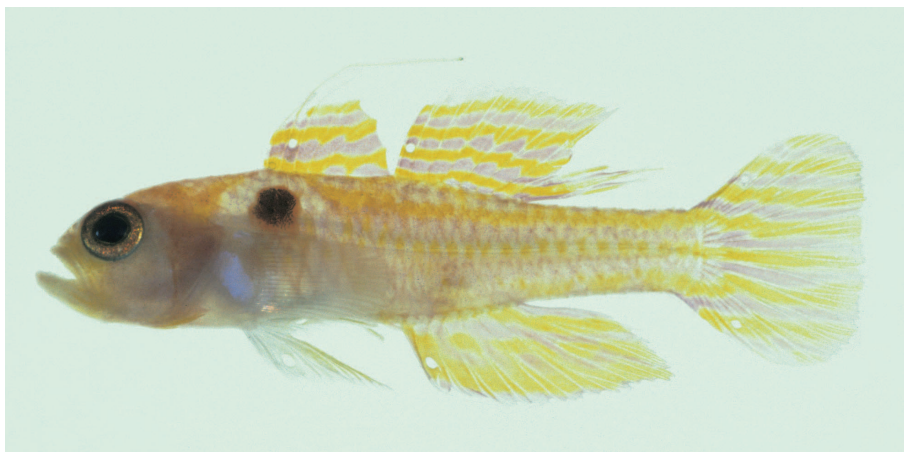
Fig. 3. Trimma nomurai , fresh specimen, KPM-NI 4109, male, holotype, 19.2 mm SL, Nakanose-higashi, Ie-jima Island, the Okinawa Islands, the Ryukyus, Japan, Photo by H. Senou.

Dorsal-fin rays VI-I, 8 (VI-I, 9); anal-fin rays I, 8 (I, 9); pectoral-fin rays 19; pelvic-fin rays I, 5; segmented caudal-fin rays 9+8; branched caudal-fin rays 6+5; longitudinal scales 23 (22); anterior transverse scales 6.5 (6); posterior transverse scales 6.5 (5); predorsal scales 6 (5); P-V 3/II II I I 0/9; vertebrae 10+16=26, gill rakers (4+11).