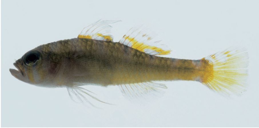
Fig. 1. Trimma yanagitai , fresh specimen, KPM-NI 3444, male, holotype, 33.0 mm SL, Izu Oceanic Park, Shizuoka Prefecture, Japan, Photo by H. Senou.

Diagnosis. Trimma yanagitai differs from the other described species of the genus in the following combination of characters; large size (largest specimen is 36.8 mm SL); 10–12 predorsal scales; second spine of first dorsal fin elongate (not filamentous) or not elongate; middle 6–11 rays of pectoral fin branched; fifth pelvic-fin ray unbranched or branched, 49–57% of fourth ray in length; no connecting membrane between innermost pelvic-fin rays; a deep interorbital trough, no postorbital trough; 18–19 pectoral fin rays; 24 longitudinal scales; cheek and opercular scales; ground color of head and body grayish brown dorsally, dull yellow to pale ventrally, seven grayish lavender saddles with broad pale pink margins on body when fresh.