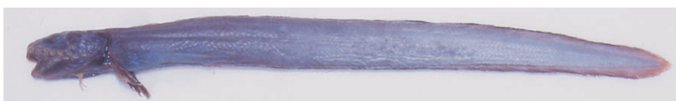
Fig. 3. Alcohol preserved specimen of Lycenchelys remissaria , off Fukushima Prefecture, Japan, holotype, ZIN 50586, photographed by G. Shinohara (November 1999)