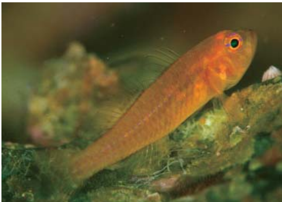
Fig. 4. Trimma kudoii , live, KPM-NR 80759, Kashiwa-jima Island, Shikoku, Japan, 33 m depth, Photo by T. Uematsu.