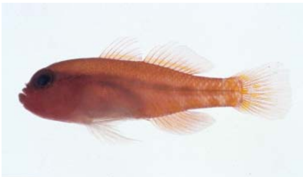
Fig. 6. Trimma yanoi , fresh specimen, KPM-NI 5649, male, holotype, 21.8 mm SL, Sotobanare-minami, Funauki Bay, Iriomote-jima Island, the Ryukyu Islands, Photo by H. Senou.

Second spine of first dorsal fin longest but not elongate, not reaching posteriorly to second dorsal fin when adpressed. Middle 14 rays of pectoral fin branched; pectoral fin reaching posteriorly to above near base of spine of anal fin (not reaching to anal fin). First 4 rays of pelvic fin with 2 sequential branch points (2–3 sequential branch points); fifth ray with 2 dichotomous branch points and 4 terminal tips, 60–64% of fourth ray in length; fourth ray longest, reaching posteriorly to base of first ray of anal fin when adpressed. No pelvic fraenum. Basal membrane between innermost pelvic-fin rays 61–64% of length of fifth ray (75%).