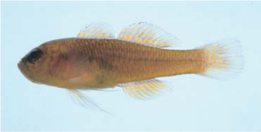
Fig. 3. Trimma kudoii , fresh specimen, BLIH 19960276, male, paratype, 25.1 mm SL, Kinkou Bay, Kagoshima Prefecture, Japan, Photo by Y. Ikeda.

nasal opening a simple pore (with low rim in 4 paratypes). Interorbital trough shallow (deep with sloping sides, wider than deep in 5 paratypes), no postorbital trough. Bony interorbital width 19% of pupil diameter (20–28% in 6 paratypes, mean 24%). The cephalic sensory system is depicted in Figure 1.