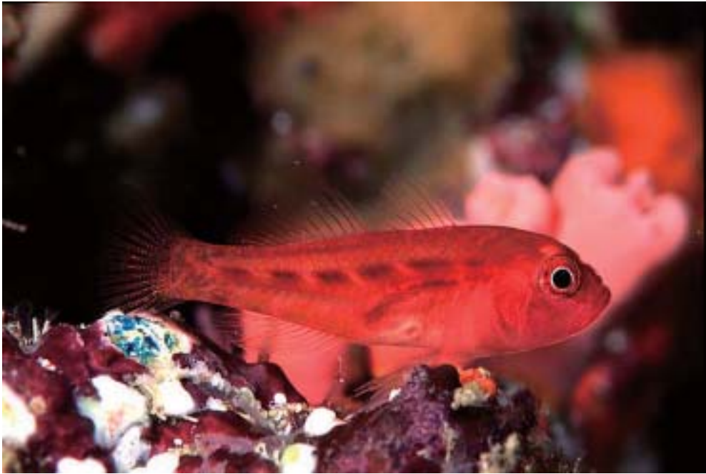
Fig. 7. Trimma yanoi , live, Iriomote-jima Island, the Ryukyu Islands, Japan, 8 m depth, Photo by K. Yano.

color of dorsal, pectoral and caudal fins pale red-dish gray. Dorsal fins with a bright yellowish orange basal stripe. Base of caudal fin with some large diffuse bright yellowish orange blotches. Anal fin light orange. Pelvic fin hyaline.