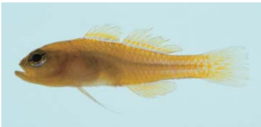
Fig. 2. Trimma kudoi , fresh specimen, KPM-NI 4255, male, holotype, 19.0 mm SL, Akinohama, Izu-ohshima Island, Izu Islands, Japan, Photo by H. Senou.

dinal scales; ground color of head and body bright yellow, iris vivid yellow with 3 deep purple oblique lines margined by pink when fresh.