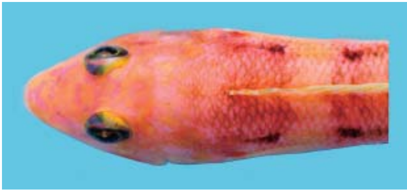
Fig. 5. Dorsal view of head of holotype of Parapercis katoi .

29; gill rakers 4+12 (3–4+12–13); pseudo-branchial filaments 21 (19–23); branchiostegal rays 6; vertebrae 10+20.