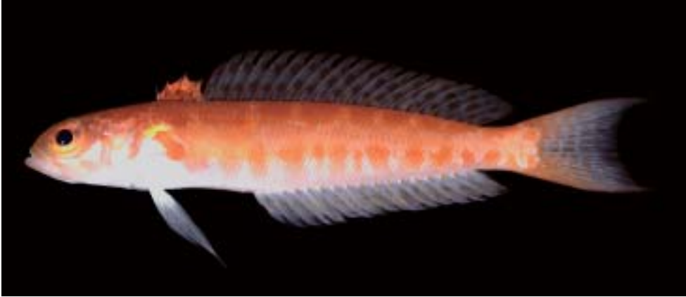
Fig. 7. Paratype of Parapercis natator , BPBM 35226, female, 54.4 mm, Ani-jima, Ogasawara Islands, 45 m.

ginate in females, lunate in males; pectoral fins slightly emarginate, 4.2–4.7 in SL; pelvic fins reaching or extending slightly posterior to origin of anal fin, 3.8–4.75 in SL; color of males in alcohol pale yellowish with a slightly oblique, broad, purplish gray bar anteriorly on body, bordered by a pale bar and a narrow purplish gray bar; color of females in alcohol pale yellowish; base of membranes of spinous portion of dorsal fin dark brown; color of males in life red to violet-red dorsally, grading to lavender-pink ventrally, with a yellow bar beneath anterior fourth of soft portion of dorsal fin, bordered by a pale-edged bright red bar; spinous portion of dorsal fin orange-red, the soft portion with many yellow spots; lobes of caudal fin deep red; a bright red spot at base and axil of pectoral fins; color of females in life light red dorsally on body with 10 darker red bars on about upper one-fourth that are narrower posteriorly; a series of 14 orangish pink bars of unequal width on lower side of body; spinous portion of dorsal fin bright orange-red, deep red to blackish at base except last membrane white; soft portion of dorsal fin with many red spots; lobes of caudal fin red; base and axil of pectoral fins in a bright red spot bordered by white; juveniles with a narrow orange stripe, bordered by white, from behind eye to upper base of caudal fin, the anterior third showing paler lateral line; ventral half of body pink; spinous portion of