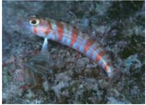
Fig. 2. Parapercis basimaculata , Nakanose, near Ie-jima Island, Ryukyu Islands, 58 m.

Color of holotype in alcohol pale yellowish with a dark brown blotch larger than pupil above opercle; 3 pairs of small dark brown spots dorsally on postorbital head, the middle pair largest, the posterior pair within anterior scaled area of nape; 2 pairs of small dark brown flecks on scale edges below spinous portion of dorsal fin, 1 above and 1 just below lateral line; another pair of small flecks on lateral line below second to third dorsal soft rays; a single dark fleck on lateral line below base of sixth dorsal soft ray, followed by 6 similar flecks to base of caudal fin; fins translucent pale yellowish; soft portion of dorsal fin with a series of 8 dark brown spots of near-pupil size, each on base of a ray; anal fin with 3 similar but smaller spots basally on twelfth, fifteenth, and