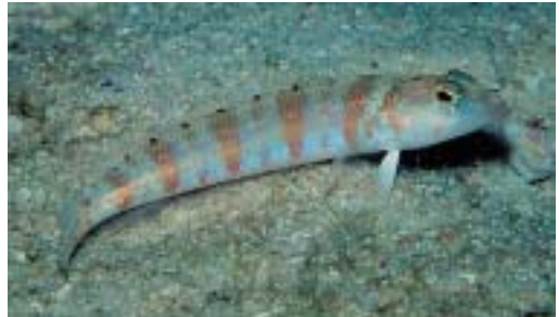
Fig. 3. Parapercis basimaculata , Seragaki, Okinawa, 50 m. Photograph KPM-NR 80807 by Yasuaki Miyamoto.

last membranes; caudal fin with a curved vertical series of 4 dark spots a little before center of fin, the 2 middle spots largest; a single dark spot on lower base of pectoral fins.