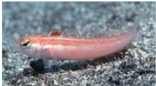
Fig. 10. Juvenile of Parapercis natator , Osezaki, Suruga Bay. Photograph KPM-NR 21994A by Yukihiko Otsuka.

sixth in anterior half of interorbital space, the sixth with a paired medial pore; 2 to 4 small pores medially in posterior interorbital space; a triangular patch of 7 or 8 small pores middorsally on posterior part of occiput; an irregular transverse double row of small pores posteriorly on occiput, with ventral branches onto opercle and