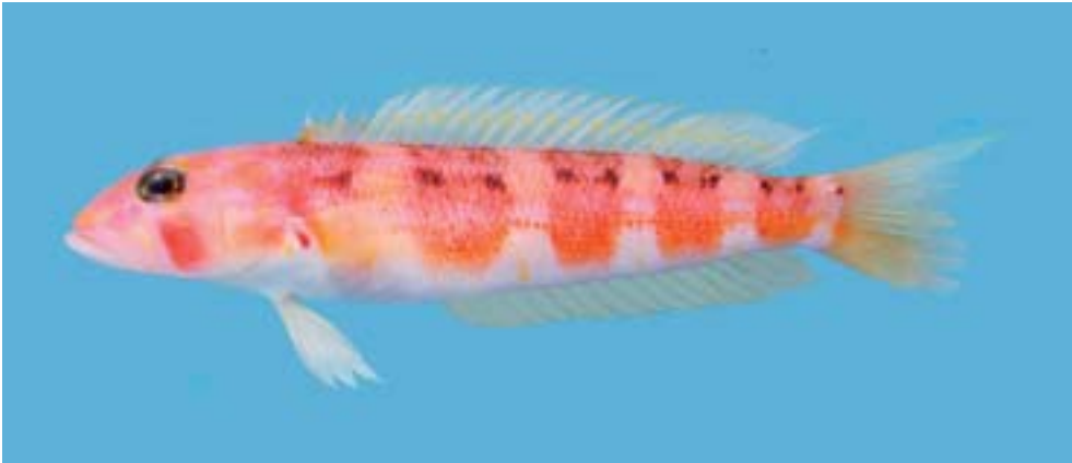
Fig. 4. Holotype of Parapercis katoi , KPM-NI 19613, 166.8 mm, Chichi-jima, Ogasawara Islands, 200 m.