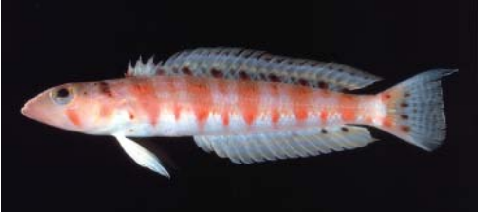
Fig. 1. Holotype of Parapercis basimaculata , NSMT-P 78771, 77.5 mm SL, Sesoko Island, Okinawa.

about two-thirds orbit diameter posterior to central margin of fin; pectoral fins 4.4 in SL; pelvic fins just reaching anus, 4.75 in SL; color in alcohol pale yellowish with a large dark brown blotch above opercle; 3 pairs of small dark brown spots dorsally on postorbital head, the middle pair largest, the posterior pair within anterior scaled area of nape; base of soft portion of dorsal fin with a series of 8 dark brown spots; caudal fin with a vertical series of 4 dark spots; posterior part of anal fin with 3 basal dark spots. Color when fresh light reddish brown, grading to white ventrally, with 5 broad, triangular, dark reddish brown bars across body, and a narrow, uniformly wide, reddish brown bar between each pair of larger bars; 2 longitudinal rows of red spots within bars, 1 dorsal and 1 ventral, each red spot of dorsal row with a dark brown fleck or pair of flecks; postorbital head with dark brown spots as in preservative; an oblique red bar on cheek; dark spots on fins as described for preserved specimen.