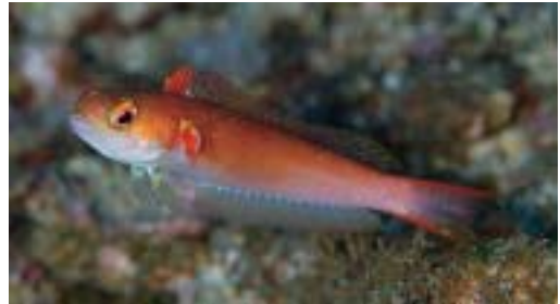
Fig. 9. Female of Parapercis natator , Yaku-shima Island, 30 m. Photograph KPM-NR 88528 by Shigeru Harazaki.