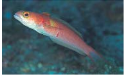
Fig. 8. Male of Parapercis natator , Yaku-shima Island, 30 m. Photograph KPM-NR 88527 by Shigeru Harazaki.

Gill membranes free from isthmus, with a broad free fold across. Gill rakers short and spinous, the longest nearly one-half length of longest gill filaments. Nostrils small, the anterior at level of dorsal edge of pupil (as viewed from side), about half way to groove at edge of upper lip, with a slight rim anteriorly and a posterior flap that reaches about half way to posterior nostril when laid back; posterior nostril dorsoposterior to anterior nostril, the aperture ovate, with a fleshy rim that is largest anteriorly. Cephalic sensory system includes a dorsal series of 6 pores on each side: first at front of snout before anterior nostril, the second a tiny pore above anterior nostril, the third between nostrils, and the fourth to