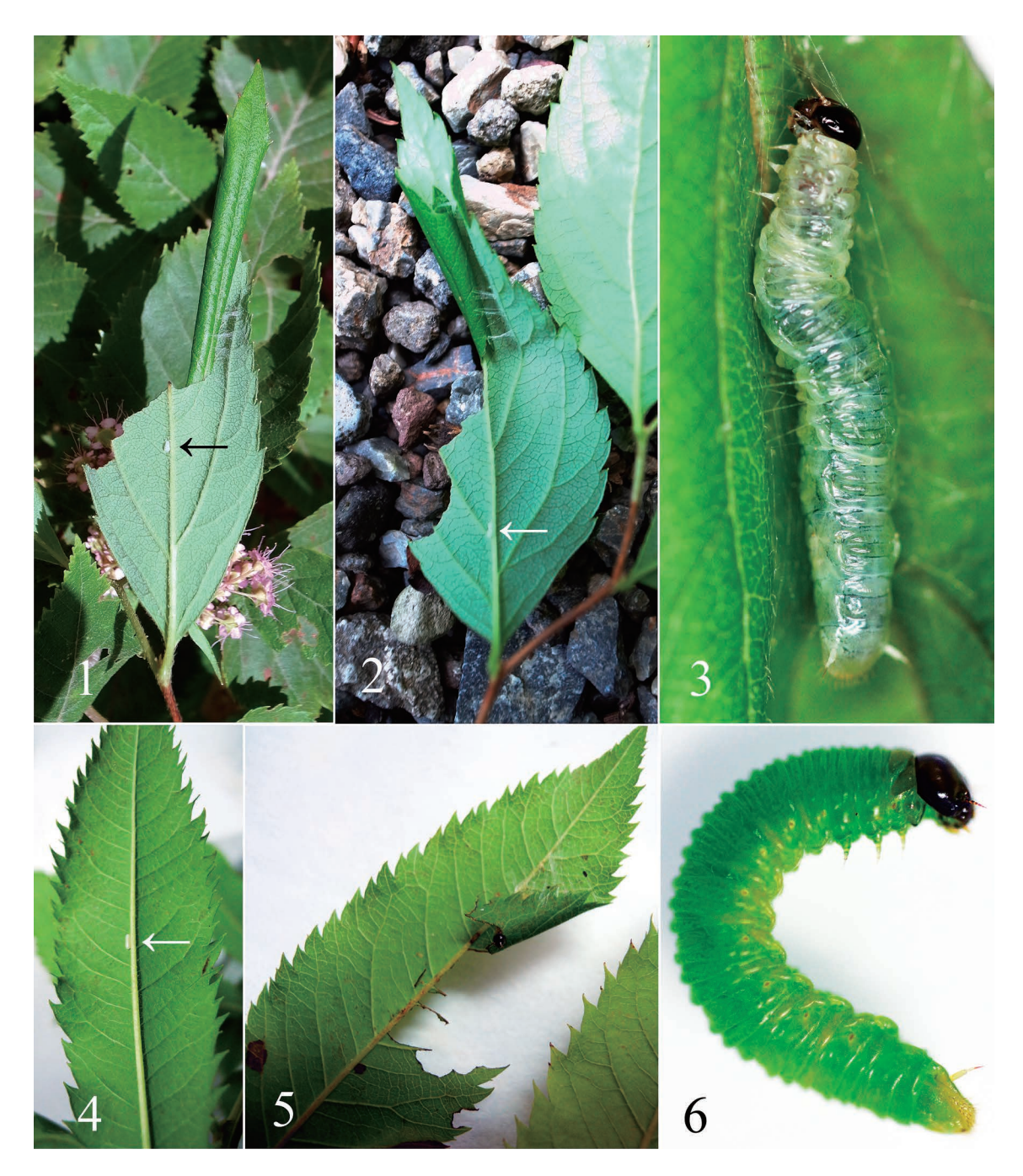
Figs. 1–6. Larval abodes and immature stages of Pamphilius daisenus .—1, Larval abode on Spiraea japonica , near Takamine-onsen, Nagano pref., August 6, 2014 (remains of egg shell arrowed); 2, larval abode on S. japonica , Hanaishi town, Tochigi pref., June 15, 2014 (remains of egg shell arrowed); 3, late instar larva in the abode shown in Fig. 2, June 19, 2014; 4, egg on a leaf of Spiraea salicifolia (arrowed) deposited by the female C 4 in Table 1, Kitanagaike, Nagano pref., June 1, 2014; 5, larval abode on S. salicifolia made by the same individual shown in Fig. 4 (4th instar larva), July 2, 2014; 6, mature larva, C 2 in Table 1, Mt. Kotomiyama, reared with Aruncus dioicus var. kamtschaticus and S. japonica (after September 1), September 10, 2013.