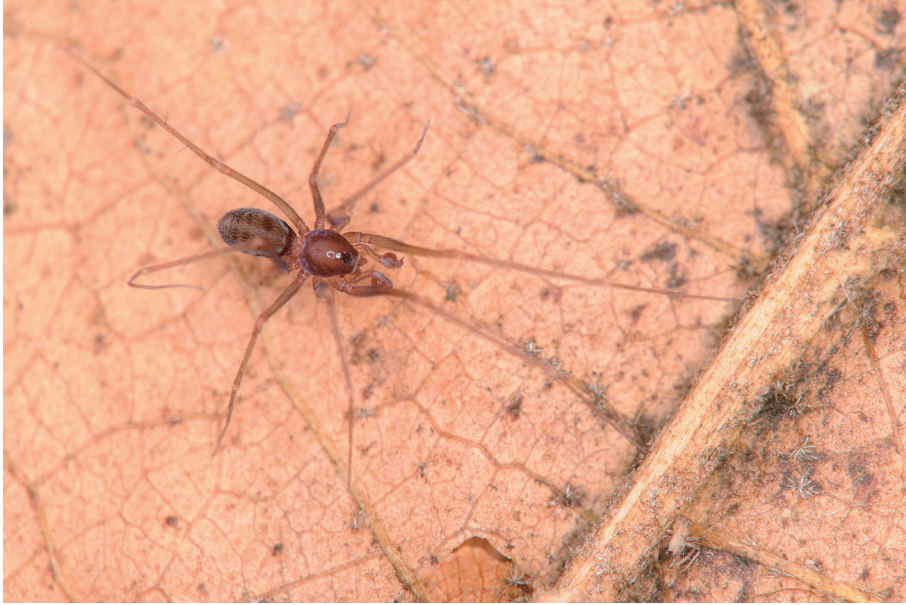
Supplementary figure. Falcileptoneta tajimiensis Irie et Ono, sp. nov., male, dorsal view (body length: 1.73 mm).