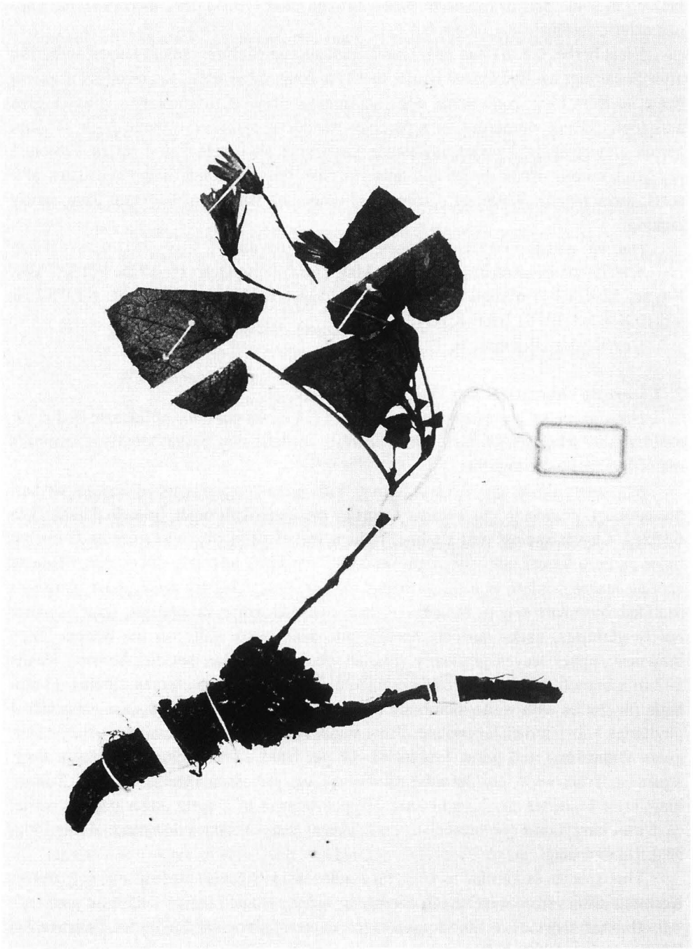
Fig. 1. Type specimen of Cicerbita chiangdaoensis H. Koyama.