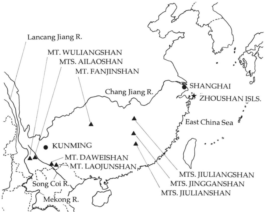
Fig. 1. Map showing collecting sites in China.

Hiroshi SAITO, Curator, Department of Zoology, National Science Museum, Tokyo (mollusks).