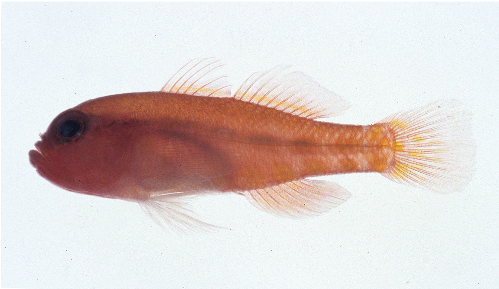
Fig. 6. Trimma yanoi , fresh specimen, KPM-NI 5649, male, holotype, 21.8 mm SL, Sotobanare-minami, Funauki Bay, Iriomote-jima Island, the Ryukyu Islands

Second spine of first dorsal fin longest but not elongate, not reaching posteriorly to second dorsal fin when adpressed. Middle 14 rays of pectoral fin branched; pectoral fin reaching posteriorly to above near base of spine of anal fin (not reaching to anal fin). First 4 rays of pelvic fin with 2 sequential branch points (2–3 sequential branch points); fifth ray with 2 dichotomous branch points and 4 terminal tips, 60–64% of fourth ray in length; fourth ray longest, reaching posteriorly to base of first ray of anal fin when adpressed. No pelvic fraenum. Basal membrane between innermost pelvic-fin rays 61–64% of length of fifth ray (75%).