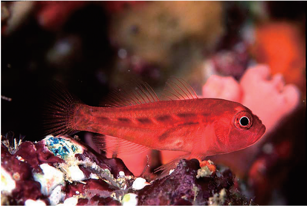
Fig. 7. Trimma yanoi , live, Iriomote-jima Island, the Ryukyu Islands, Japan, 8 m depth, Photo by K. Yano.

color of dorsal, pectoral and caudal fins pale red-dish gray. Dorsal fins with a bright yellowish orange basal stripe. Base of caudal fin with some large diffuse bright yellowish orange blotches. Anal fin light orange. Pelvic fin hyaline.