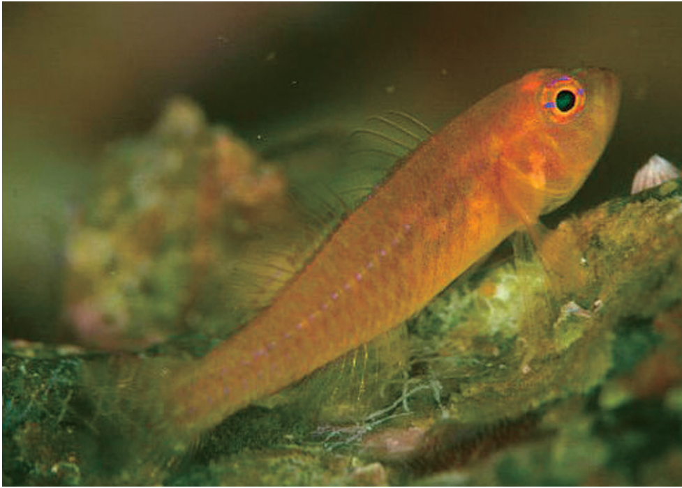
Fig. 4. Trimma kudoii , live, KPM-NR 80759, Kashiwa-jima Island, Shikoku, Japan, 33 m depth, Photo by T. Uematsu.