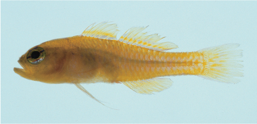
Fig. 2. Trimma kudoii , fresh specimen, KPM-NI 4255, male, holotype, 19.0 mm SL, Akinohama, Izu-ohshima Island, Izu Islands, Japan, Photo by H. Senou.

dinal scales; ground color of head and body bright yellow, iris vivid yellow with 3 deep purple oblique lines margined by pink when fresh.