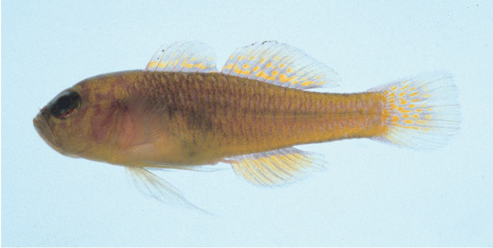
Fig. 3. Trimma kudoii , fresh specimen, BLIH 19960276, male, paratype, 25.1 mm SL, Kinkou Bay, Kagoshima Prefecture, Japan, Photo by Y. Ikeda.

nasal opening a simple pore (with low rim in 4 paratypes). Interorbital trough shallow (deep with sloping sides, wider than deep in 5 paratypes), no postorbital trough. Bony interorbital width 19% of pupil diameter (20–28% in 6 paratypes, mean 24%). The cephalic sensory system is depicted in Figure 1.