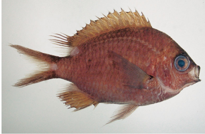
Fig. 2. Chromis onumai sp. nov., ASIZP 0062621, holotype, 118.2 mm SL, Eluanbi, Pingtung, Taiwan.

bluish white spot of pupil size at middle of the base; anal fin light yellowish to reddish brown in anterior three-fourths, and the posterior one-fourth whitish and translucent with a faint, bluish white spot of pupil size at base of posterior rays; pectoral fin transparent, the upper corner of base and axil black; pelvic fin light yellowish to reddish brown, the anterior edge whitish.