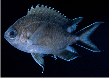
Fig. 3. Chromis onumai sp. nov., NSMT-P 73060, paratype, 56.8 mm SL, Izu-oshima Island, Izu Islands.