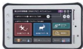
Audio Guide to Permanent Exhibition

You can use your smartphone or other mobile device to explore descriptions of our collection and more. Available for, Japanese, English, Chinese, and Korean.