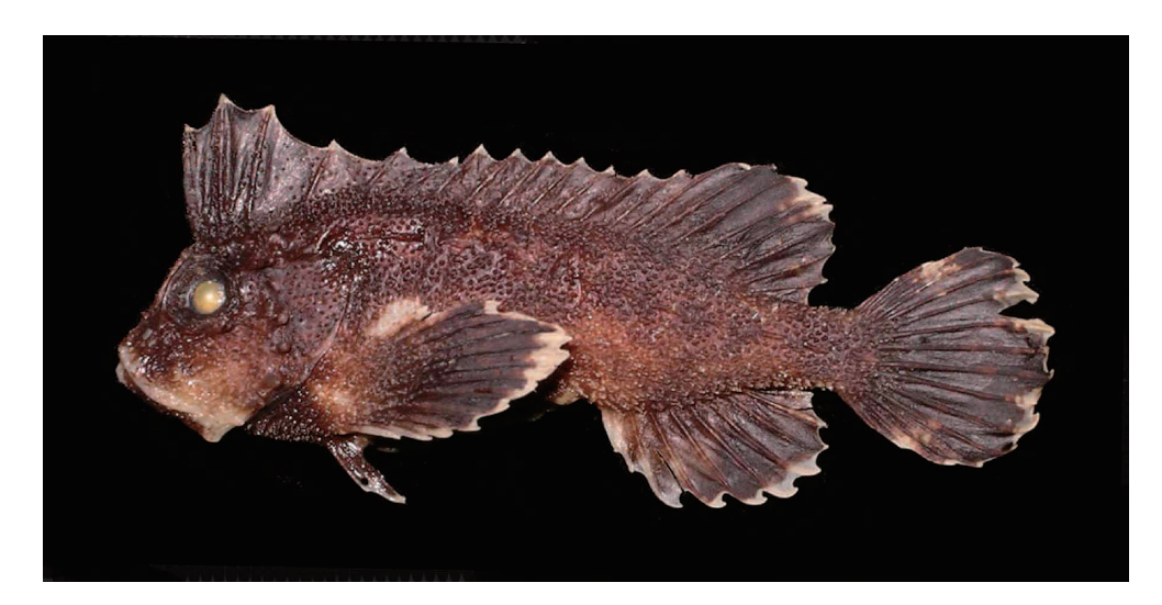
Fig. 1. Cocotropus possi sp. nov., NSMT-P 76417, holotype, 34.5 mm SL, Ryukyu Islands, southern Japan (70% ethanol-preserved condition).