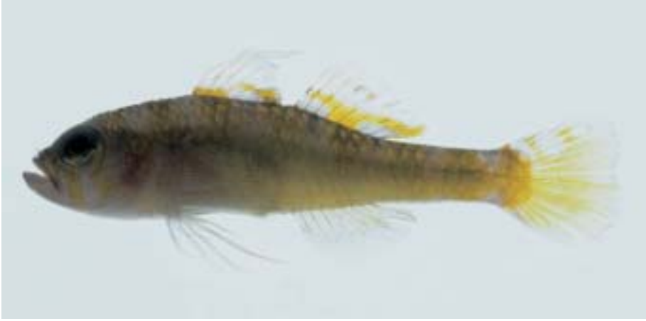
Fig. 1. Trimma yanagitai , fresh specimen, KPM-NI 3444, male, holotype, 33.0 mm SL, Izu Oceanic Park, Shizuoka Prefecture, Japan, Photo by H. Senou.

Diagnosis. Trimma yanagitai differs from the other described species of the genus in the following combination of characters; large size (largest specimen is 36.8 mm SL); 10–12 predorsal scales; second spine of first dorsal fin elongate (not filamentous) or not elongate; middle 6–11 rays of pectoral fin branched; fifth pelvic-fin ray unbranched or branched, 49–57% of fourth ray in length; no connecting membrane between innermost pelvic-fin rays; a deep interorbital trough, no postorbital trough; 18–19 pectoral fin rays; 24 longitudinal scales; cheek and opercular scales; ground color of head and body grayish brown dorsally, dull yellow to pale ventrally, seven grayish lavender saddles with broad pale pink margins on body when fresh.