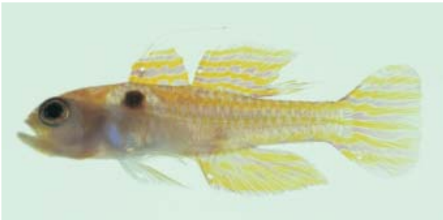
Fig. 3. Trimma nomurai , fresh specimen, KPM-NI 4109, male, holotype, 19.2 mm SL, Nakanose-higashi, Ie-jima Island, the Okinawa Islands, the Ryukyus, Japan, Photo by H. Senou.

Dorsal-fin rays VI-I, 8 (VI-I, 9); anal-fin rays I, 8 (I, 9); pectoral-fin rays 19; pelvic-fin rays I, 5; segmented caudal-fin rays 9+8; branched caudal-fin rays 6+5; longitudinal scales 23 (22); anterior transverse scales 6.5 (6); posterior transverse scales 6.5 (5); predorsal scales 6 (5); P-V 3/II II I I 0/9; vertebrae 10+16=26, gill rakers (4+11).