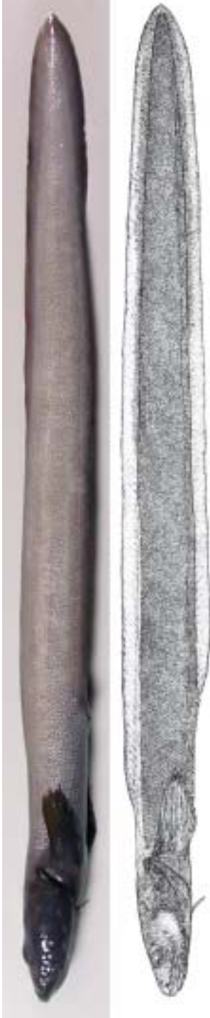
Fig. 1. Lycenchelys ryukyuensis sp. nov., Okinawa Trough, East China Sea, Japan, holotype, NSMT-P 63965, male, 159.8 mm SL. Fresh specimen (top), line drawings (bottom)

Nature and Science (formerly National Science Museum), Tokyo (NSMT), Laboratory of Marine Biology, Kochi University (BSKU), Laboratory of Marine Biology and Biodiversity, Hokkaido University (HUMZ), and Zoological Institute, Russian Academy of Sciences, St. Petersburg (ZIN).