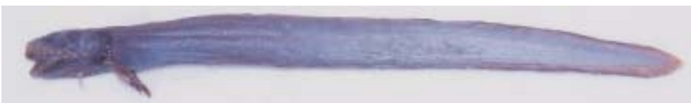
Fig. 3. Alcohol preserved specimen of Lycenchelys remissaria , off Fukushima Prefecture, Japan, holotype, ZIN 50586, photographed by G. Shinohara (November 1999)