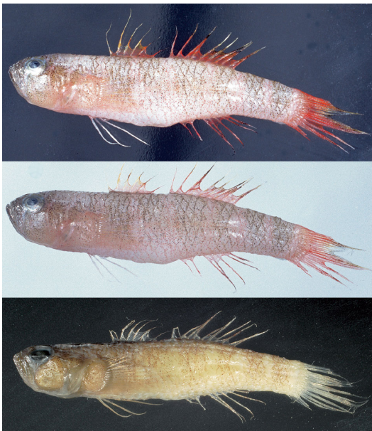
Fig. 1. Fresh (top and middle) and preserved (bottom) conditions of Priolepis winterbottomi sp. nov., holotype, BSKU 64659, female, 31.9 mm SL.

Proportional measurements are given in Table 1. Body slender, slightly compressed. Head rather depressed, its width 108.8–114.6% of height. Snout short. Eye large, located dorsolaterally. Eye diameter greater than snout length. Interorbital space wide, almost equal to pupil diameter. No dermal ridge on mid-line of nape. Mouth terminal, oblique, forming an angle of about 50° with body axis. Lower jaw projecting beyond upper jaw. Posterior end of jaws reaching between vertical lines at anterior rims of eye and