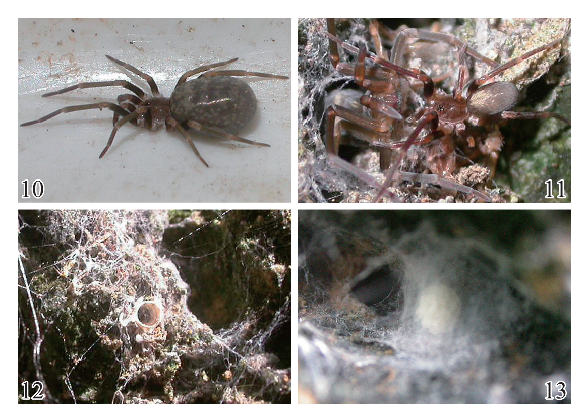
Figs. 10–13. Tricalamus ryukyuensis sp. nov. — 10, Female (one of the paratypes), body length 4.98 mm; 11, female (left) and male (right) at the entrance of the female's retreat, body length of the male, 2.58 mm; 12, web of a female, diameter of the entrance of retreat, ca. 5 mm; 13, egg sac, diameter of the cluster, ca. 3 mm.

forest. Webs are made of delicate threads with a simple round entrance of tubular retreat at the middle (Fig. 12). An egg sac with about 40 eggs in the retreat was photographed (Fig. 13).