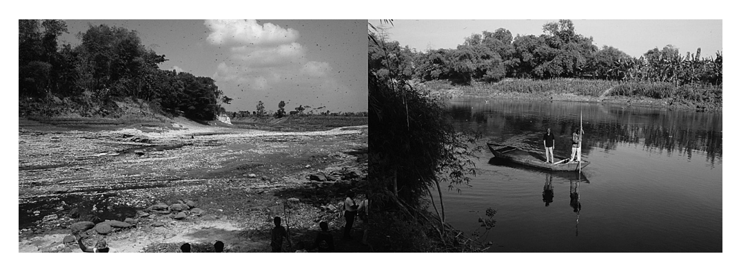
Fig. 1. The Sambungmacan canal site (left) and the discovery site of Sm 3 and 4 (right).

Homo erectus and Modern Human Origins in Australasia