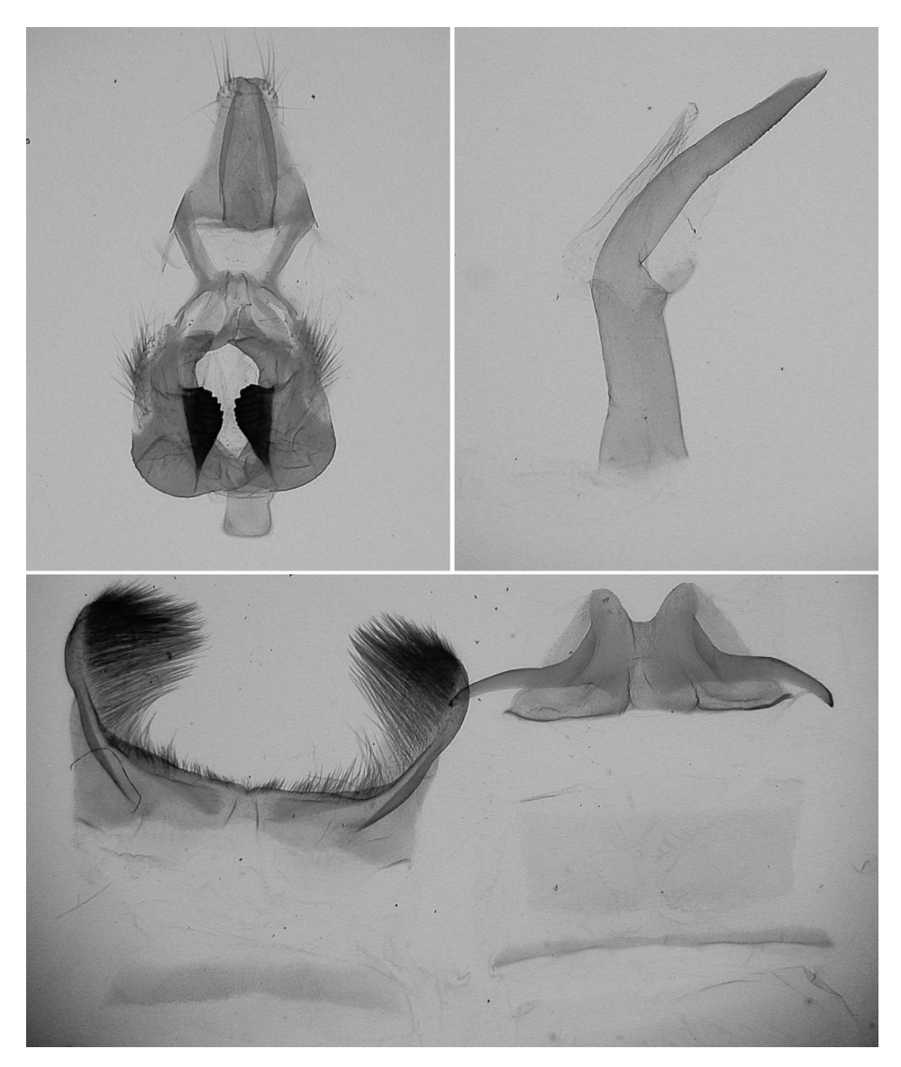
Fig. 9. Male genitalia of Soritia tahuythinhi.

whitish yellow, 4 to 5 blue patches around discocellular vein.