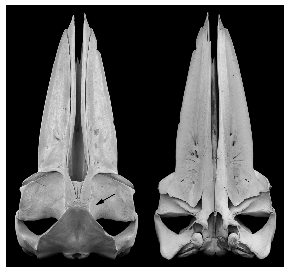
Fig. 5. Standardized dorsal and ventral views of the skull of Balaenoptera omurai (PMBC11621) in the Phuket Marine Biological Center. In this species posterior end of maxilla broadens and parietal is clearly visible (arrow) in dorsal view.