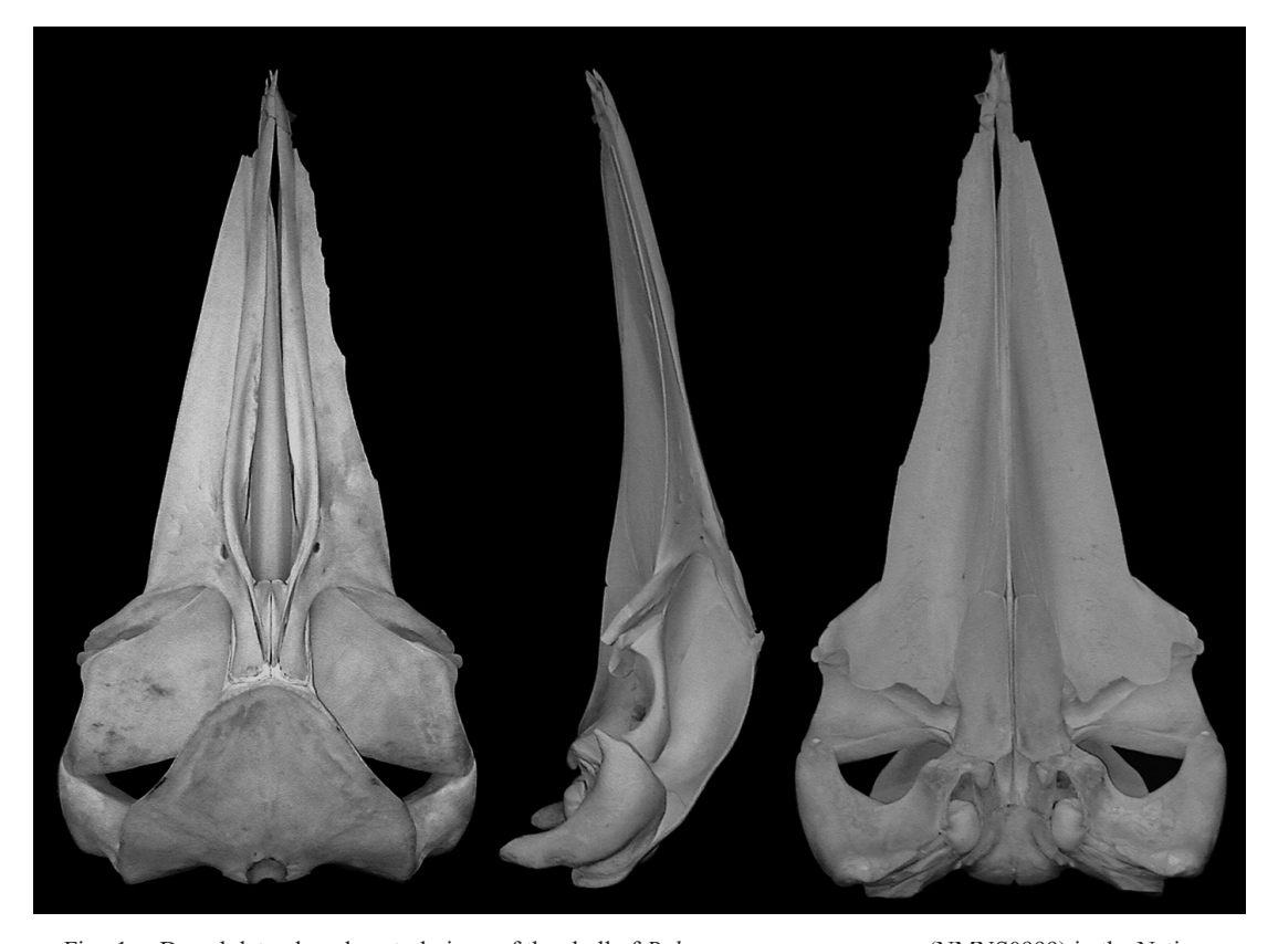
Fig. 1. Dorsal, lateral, and ventral views of the skull of Balaenoptera acutorostrata (NMNS0999) in the National Museum of Natural Science in Taichung. These photographs were taken following the standardized protocol we propose (see text). Note right lateral edge of maxilla is damaged.

Specimens examined in this study are listed in Table 1. They are preserved in institutions in Tai-