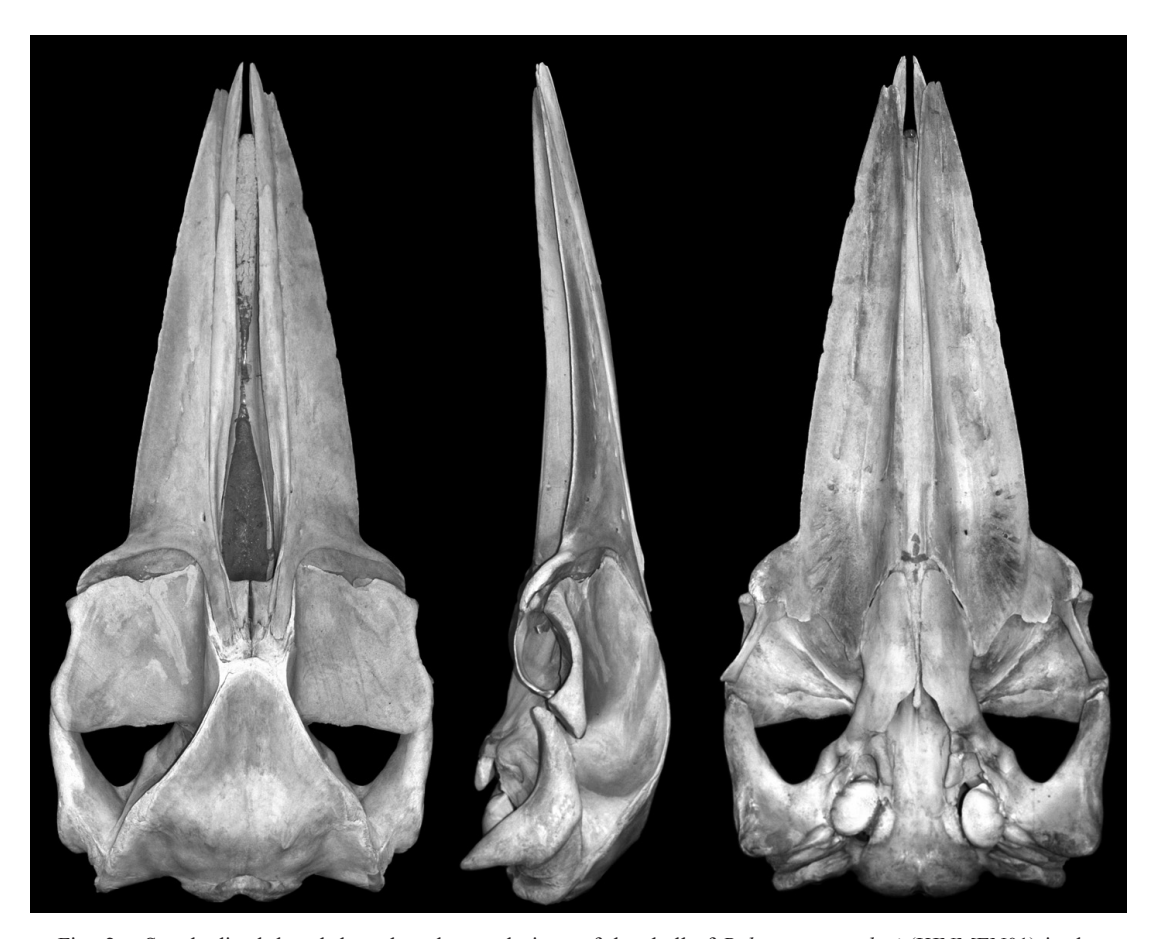
Fig. 2. Standardized dorsal, lateral, and ventral views of the skull of Balaenoptera edeni (KINMEN01) in the Kinmen National Park. Note posterior end of maxilla is slender and round.

Wada et al. (2003), in their original description of Balaenoptera omurai, summarized diagnostic characters. Since diagnostic characters for B. musculus, B. physalus, B. borealis, and B. acutorostrata (Fig. 1) are obviously distinct, we only discuss disputable three species, B. edeni (Figs 2, 3), B. brydei (Fig. 4), and B. omurai (Fig. 5). We chose following five characters for species identification of above-mentioned three species (Table 2):