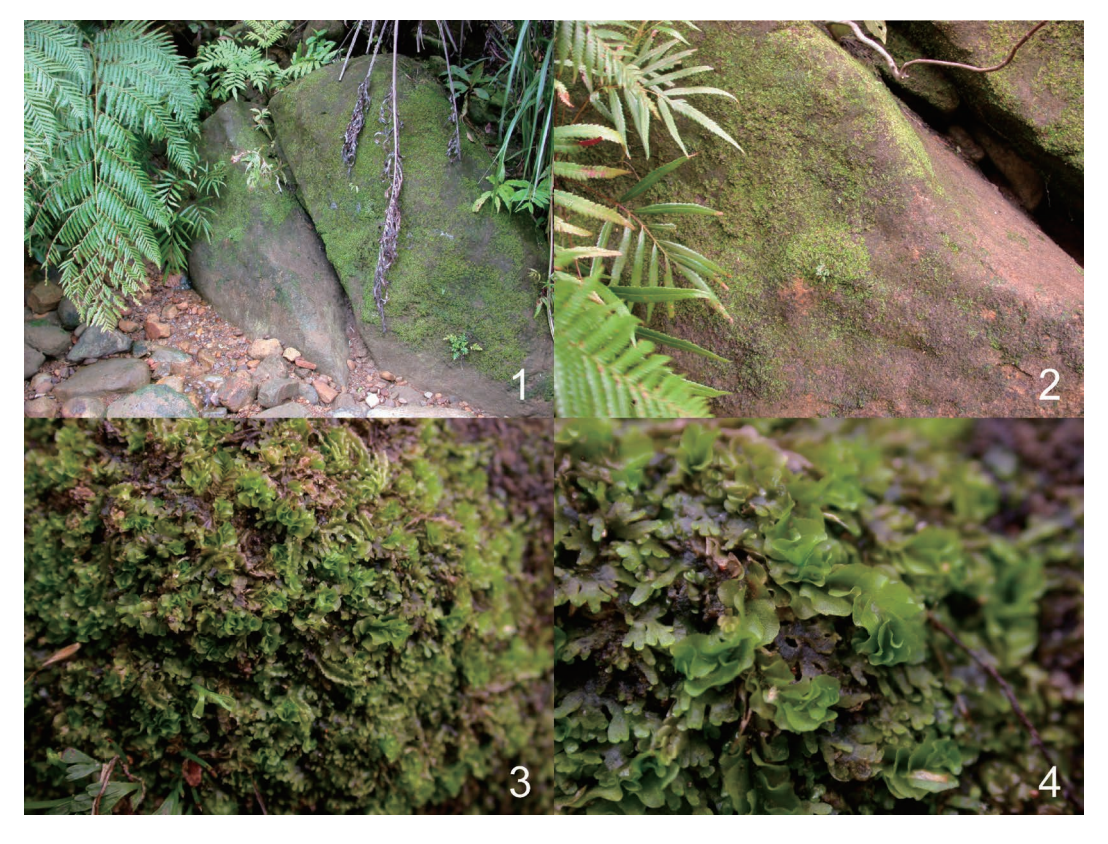
Figs. 1–4. Habitats of Fossombronia mylioides Inoue. 1, 2. Plants are growing on boulder covered with sandy soil on the riverside. 3, 4. Plants are associated with Riccardia sp. Photo by M. Higuchi on March 11, 2011.

Specimens examined. Japan. Ryukyu Islands, Iriomote Island, Okinawa Pref., Yaeyama-gun, Taketomi-cho, upper stream of Nakama River, southeast of Island, south of Mt. Gozadake, 24°17′47N, 123°49′43E, 30 m alt., March 11, 2011, coll. M. Higuchi 53855, 53856 (TNS); Urauchi River, January 14, 1973, coll. H. Inoue 21055 (type in TNS); March 18, 1998, coll. T. Yamaguchi, no. 142 in Fasc. 6 of the exciccatae series "Bryophytes of Asia" (TNS).