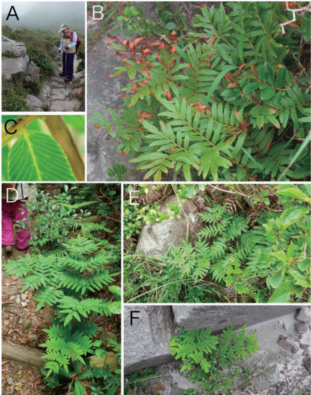
Fig. 2. Osmunda lancea -like plant and O. japonica at the top of Mt. Tenjo, Kozu Island. A–C. O. lancea -like plant. A. Habitat. B. Leaf. C. Base of pinnule. D–F. O. japonica .

O. × intermedia , which were identified by NewHybrids analysis using ten nuclear DNA markers in Yatabe et al. (2009).