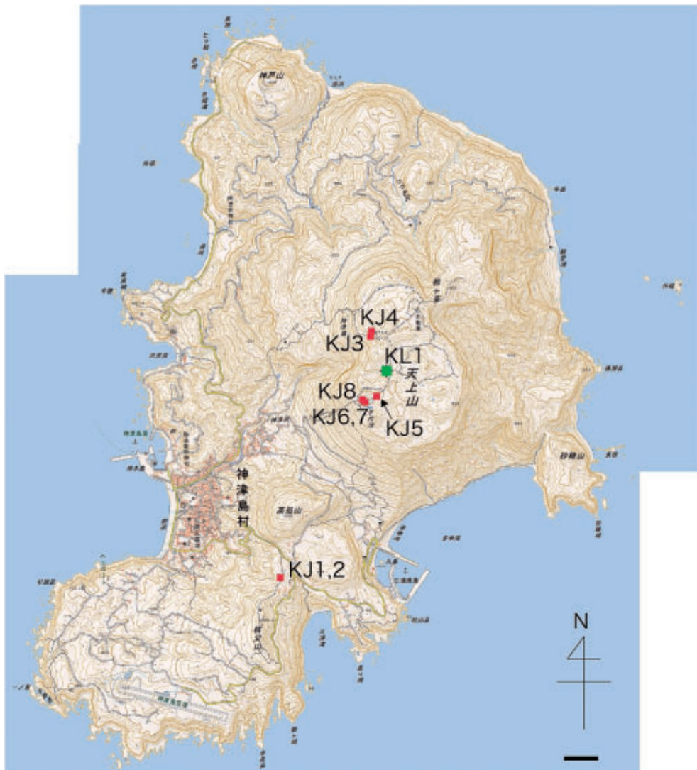
Fig. 1. Localities of Osmunda lancea -like plant (green square) and O. japonica (red squares) at Mt. Tenjo in the Kozu island. Sample IDs are identical to those of Table 1. The basemap is the 1:25,000 topographic map (Kozu island) published by Geospatial Information Authority of Japan. Scale bar = 300 m.

In a morphological analysis, five pinnules of