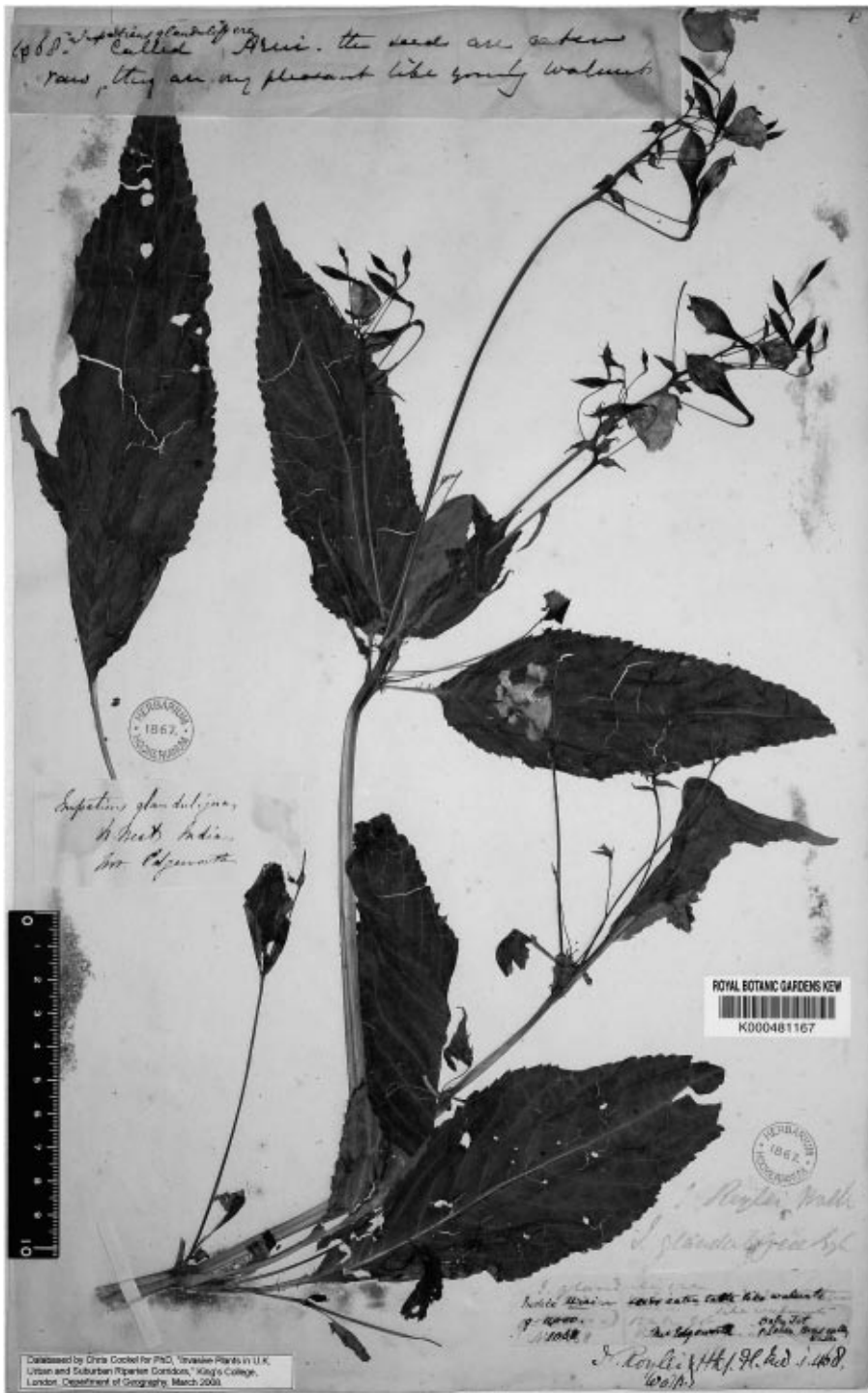
Fig. 2. Impatiens glandulifera Royle (= I. roylei Walp.) identified by Hooker (Edgeworth 1068, K000481167).