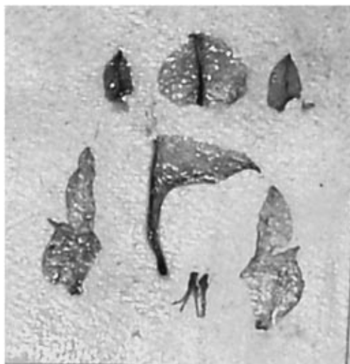
Fig. 7. Dissected flower in capsule on lectotype sheet of Impatiens amplexicaulis .

Hara (1979) cited three specimens, Polunin, Sykes & Williams 4908 from W Nepal, Polunin 1642 from C Nepal, and Hara et al. 720737 from E Nepal, as I. amplexicaulis . Those specimens