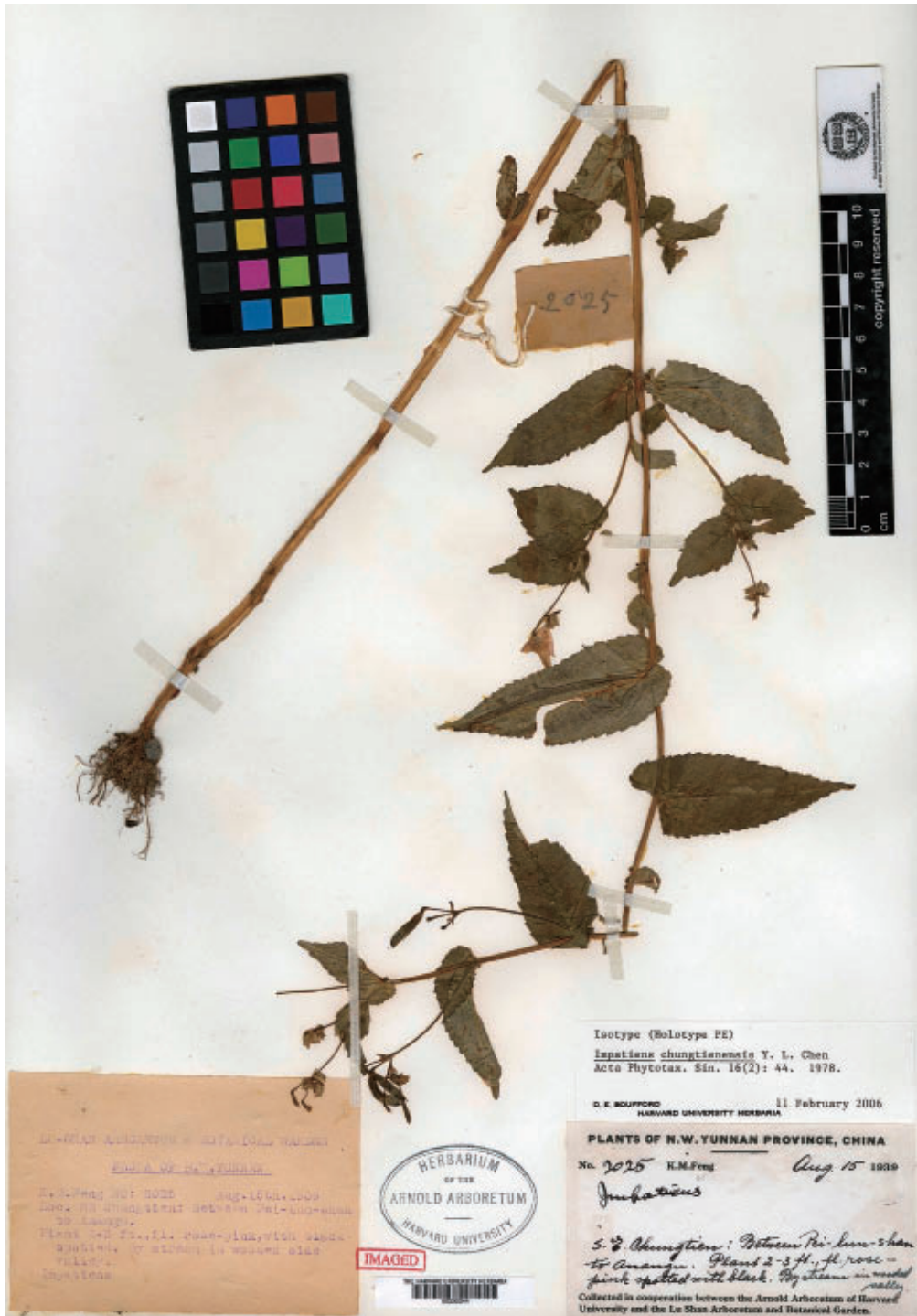
Fig. 4. Isotype of Impatiens chungtienensis Y.L.Chen (K. M. Feng 2025, 15 Aug. 1939, A).