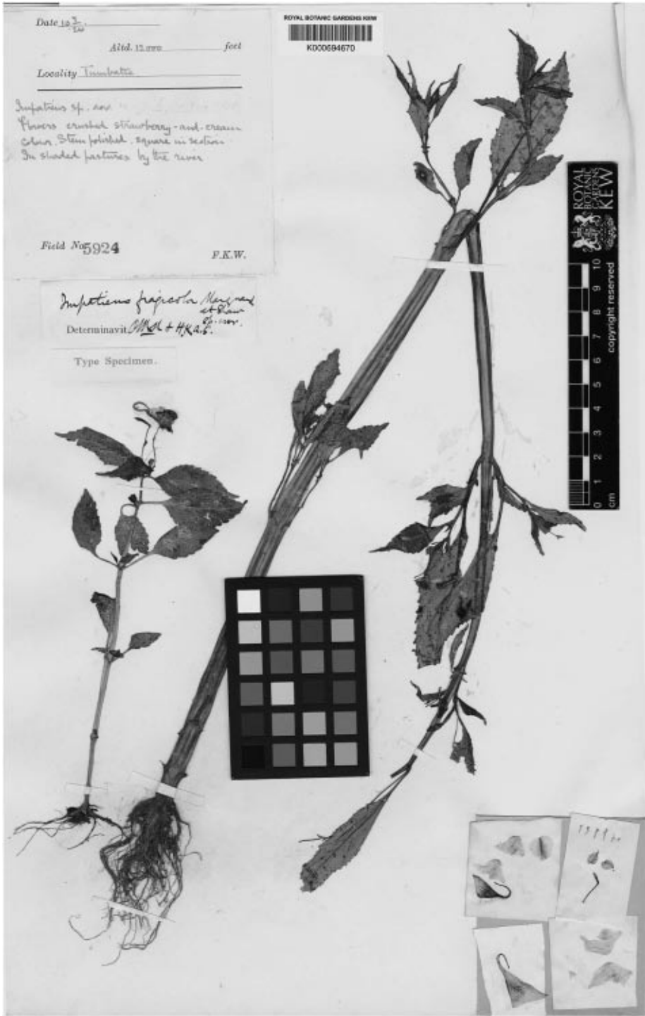
Fig. 6. Holotype of Impatiens fragicolor Marq. & Airy Shaw (F. K. Ward 5924, K000694670).