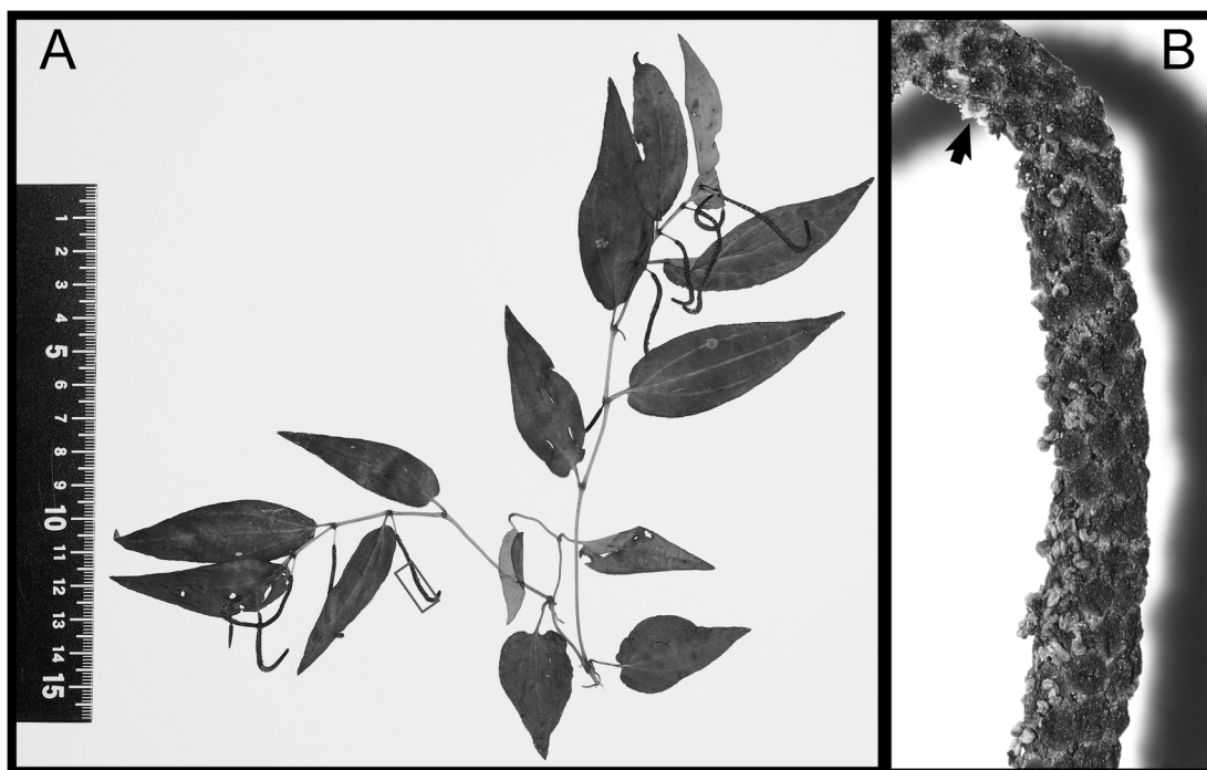
Fig. 2. The herbarium specimen (GK14625) of the Piper sp. searched in the present study. A, A whole image. B, A magnified male inflorescence, which is indicated with red square in Fig. 2A. Note that only the anther indicated with black arrow is releasing pollen grains.