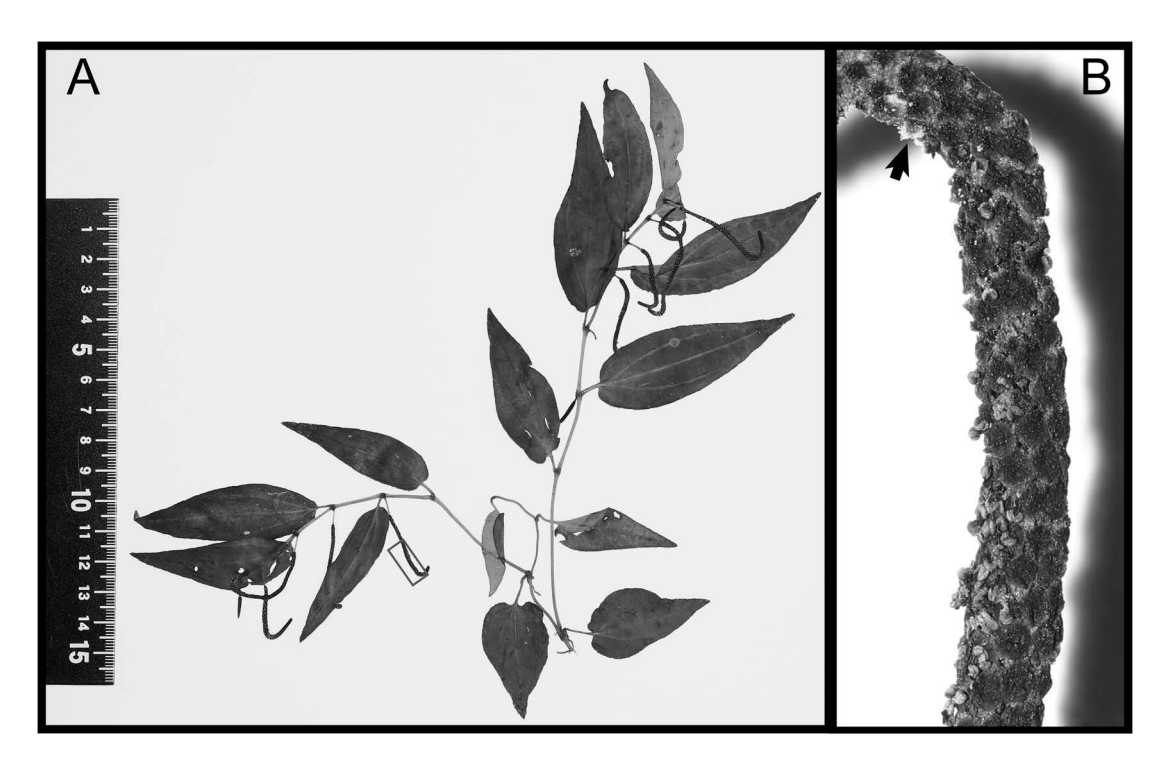
Fig. 2. The herbarium specimen (GK14625) of the Piper sp. searched in the present study. A, A whole image. B, A magnified male inflorescence, which is indicated with red square in Fig. 2A. Note that only the anther indicated with black arrow is releasing pollen grains.