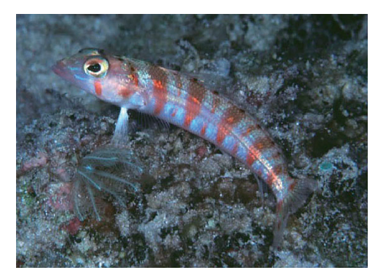
Fig. 2. Parapercis basimaculata, Nakanose, near Ie-jima Island, Ryukyu Islands, 58 m. Photograph KPM-NR 36612 by Kyo Yunokawa.

Color of holotype in alcohol pale yellowish with a dark brown blotch larger than pupil above opercle; 3 pairs of small dark brown spots dorsally on postorbital head, the middle pair largest, the posterior pair within anterior scaled area of nape; 2 pairs of small dark brown flecks on scale edges below spinous portion of dorsal fin, 1 above and 1 just below lateral line; another pair of small flecks on lateral line below second to third dorsal soft rays; a single dark fleck on lateral line below base of sixth dorsal soft ray, followed by 6 similar flecks to base of caudal fin; fins translucent pale yellowish; soft portion of dorsal fin with a series of 8 dark brown spots of near-pupil size, each on base of a ray; anal fin with 3 similar but smaller spots basally on twelfth, fifteenth, and