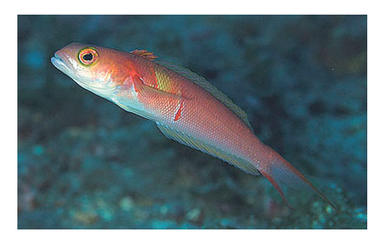
Fig. 8. Male of Parapercis natator , Yaku-shima Island, 30 m. Photograph KPM-NR 88527 by Shigeru Harazaki.

Gill membranes free from isthmus, with a broad free fold across. Gill rakers short and spinous, the longest nearly one-half length of longest gill filaments. Nostrils small, the anterior at level of dorsal edge of pupil (as viewed from side), about half way to groove at edge of upper lip, with a slight rim anteriorly and a posterior flap that reaches about half way to posterior nostril when laid back; posterior nostril dorsoposterior to anterior nostril, the aperture ovate, with a fleshy rim that is largest anteriorly. Cephalic sensory system includes a dorsal series of 6 pores on each side: first at front of snout before anterior nostril, the second a tiny pore above anterior nostril, the third between nostrils, and the fourth to