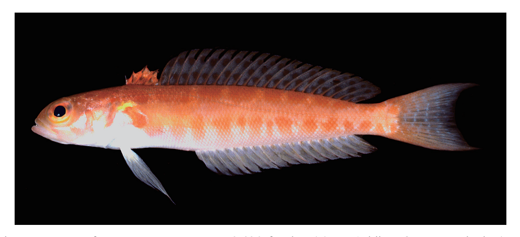
Fig. 7. Paratype of Parapercis natator , BPBM 35226, female, 54.4 mm, Ani-jima, Ogasawara Islands, 45 m.

ginate in females, lunate in males; pectoral fins slightly emarginate, 4.2-4.7 in SL; pelvic fins reaching or extending slightly posterior to origin of anal fin, 3.8-4.75 in SL; color of males in alcohol pale vellowish with a slightly oblique, broad, purplish gray bar anteriorly on body, bordered by a pale bar and a narrow purplish gray bar; color of females in alcohol pale yellowish; base of membranes of spinous portion of dorsal fin dark brown; color of males in life red to violet-red dorsally, grading to lavender-pink ventrally, with a yellow bar beneath anterior fourth of soft portion of dorsal fin, bordered by a paleedged bright red bar; spinous portion of dorsal fin orange-red, the soft portion with many yellow spots; lobes of caudal fin deep red; a bright red spot at base and axil of pectoral fins; color of females in life light red dorsally on body with 10 darker red bars on about upper one-fourth that are narrower posteriorly; a series of 14 orangish pink bars of unequal width on lower side of body; spinous portion of dorsal fin bright orangered, deep red to blackish at base except last membrane white; soft portion of dorsal fin with many red spots; lobes of caudal fin red; base and axil of pectoral fins in a bright red spot bordered by white; juveniles with a narrow orange stripe, bordered by white, from behind eye to upper base of caudal fin, the anterior third showing paler lateral line; ventral half of body pink; spinous portion of