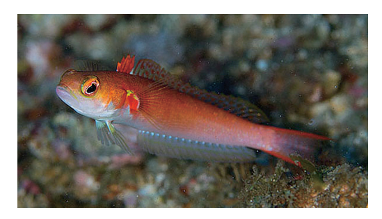
Fig. 9. Female of Parapercis natator , Yaku-shima Island, 30 m. Photograph KPM-NR 88528 by Shigeru Harazaki.