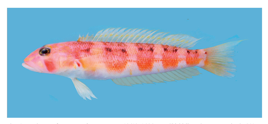
Fig. 4. Holotype of Parapercis katoi , KPM-NI 19613, 166.8 mm, Chichi-jima, Ogasawara Islands, 200 m.