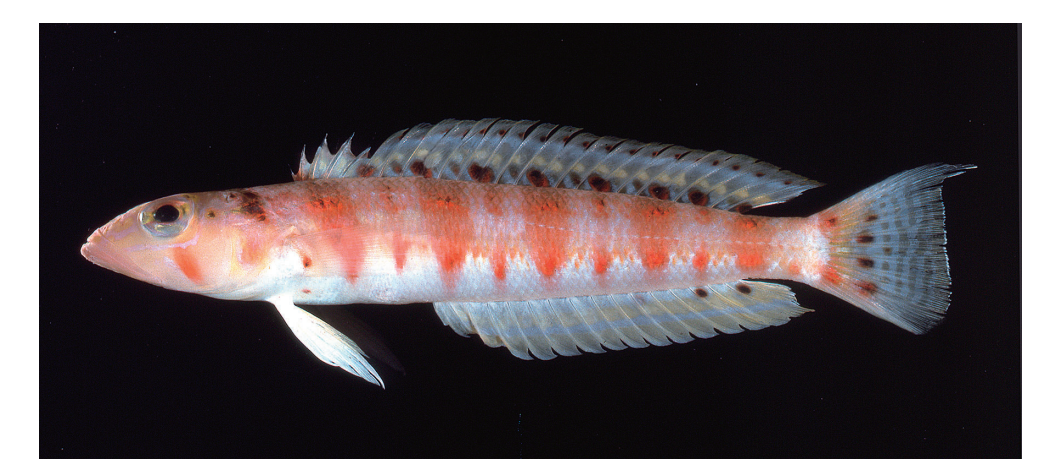
Fig. 1. Holotype of Parapercis basimaculata , NSMT-P 78771, 77.5 mm SL, Sesoko Island, Okinawa. Photograph by John E. Randall.

about two-thirds orbit diameter posterior to central margin of fin; pectoral fins 4.4 in SL; pelvic fins just reaching anus, 4.75 in SL; color in alcohol pale yellowish with a large dark brown blotch above opercle; 3 pairs of small dark brown spots dorsally on postorbital head, the middle pair largest, the posterior pair within anterior scaled area of nape; base of soft portion of dorsal fin with a series of 8 dark brown spots; caudal fin with a vertical series of 4 dark spots; posterior part of anal fin with 3 basal dark spots. Color when fresh light reddish brown, grading to white ventrally, with 5 broad, triangular, dark reddish brown bars across body, and a narrow, uniformly wide, reddish brown bar between each pair of larger bars; 2 longitudinal rows of red spots within bars, 1 dorsal and 1 ventral, each red spot of dorsal row with a dark brown fleck or pair of flecks; postorbital head with dark brown spots as in preservative; an oblique red bar on cheek; dark spots on fins as described for preserved specimen.