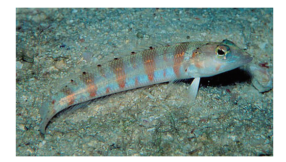
Fig. 3. Parapercis basimaculata , Seragaki, Okinawa, 50 m. Photograph KPM-NR 80807 by Yasuaki Miyamoto.

last membranes; caudal fin with a curved vertical series of 4 dark spots a little before center of fin, the 2 middle spots largest; a single dark spot on lower base of pectoral fins.