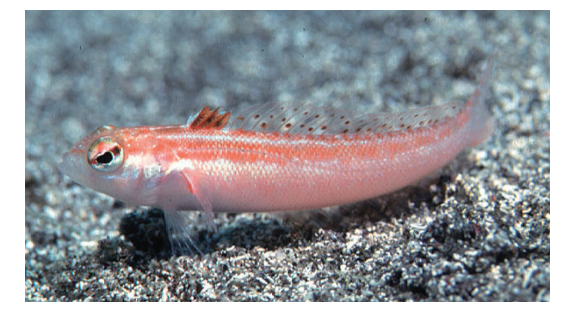
Fig. 10. Juvenile of Parapercis natator , Osezaki, Suruga Bay. Photograph KPM-NR 21994A by Yukihiko Otsuka.

sixth in anterior half of interorbital space, the sixth with a paired medial pore; 2 to 4 small pores medially in posterior interorbital space; a triangular patch of 7 or 8 small pores middorsally on posterior part of occiput; an irregular transverse double row of small pores posteriorly on occiput, with ventral branches onto opercle and