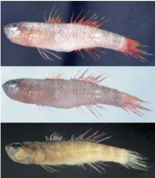
Fig. 1. Fresh (top and middle) and preserved (bottom) conditions of Priolepis winterbottomi sp. nov., holotype, BSKU 64659, female, 31.9 mm SL.

Proportional measurements are given in Table 1. Body slender, slightly compressed. Head rather depressed, its width 108.8–114.6% of height. Snout short. Eye large, located dorsolaterally. Eye diameter greater than snout length. Interorbital space wide, almost equal to pupil diameter. No dermal ridge on mid-line of nape. Mouth terminal, oblique, forming an angle of about 50° with body axis. Lower jaw projecting beyond upper jaw. Posterior end of jaws reaching between vertical lines at anterior rims of eye and