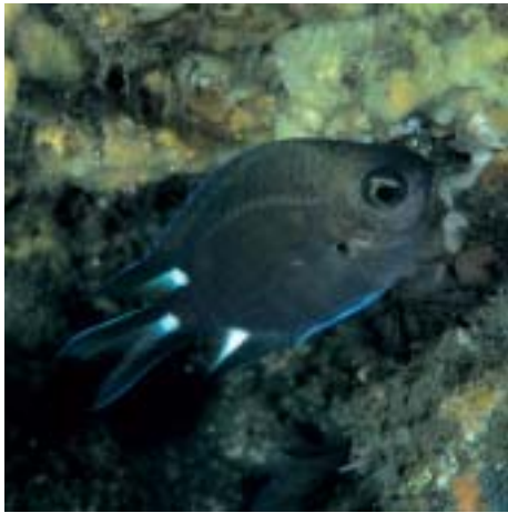
Fig. 4. Chromis onumai sp. nov., Izu-oshima Island, Izu Islands, 51 m depth. Photographed (KPM-NR 89367) by T. Kudo.

Lecchini and Williams, 2004). Of these, the new species is distinguished from all but 2 species ( Chromis albomaculata Kamohara, 1960, from Japan and Chromis verater Jordan and Metz, 1912, from the Hawaiian Islands; see Randall et al. , 1981, about the data for the former, and Randall and Swerdloff, 1973 for the latter) by the following combination of characters: dorsal rays XIV, 12–13; anal rays II, 12–13; pectoral rays 19–20; spiniform dorsal and ventral procurrent rays 3 in each; tubed lateral line scales 16–17; gill rakers 5–7+19–20=25–27. From C. albomaculata , the new species is easily distinguished by its distinctive color pattern: 3 white spots pos-