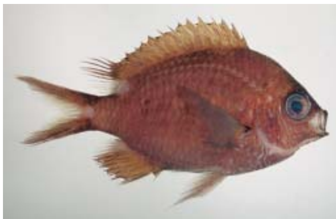
Fig. 2. Chromis onumai sp. nov., ASIZP 0062621, holotype, 118.2 mm SL, Eluanbi, Pingtung, Taiwan.

bluish white spot of pupil size at middle of the base; anal fin light yellowish to reddish brown in anterior three-fourths, and the posterior one-fourth whitish and translucent with a faint, bluish white spot of pupil size at base of posterior rays; pectoral fin transparent, the upper corner of base and axil black; pelvic fin light yellowish to reddish brown, the anterior edge whitish.