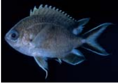
Fig. 3. Chromis onumai sp. nov., NSMT-P 73060, paratype, 56.8 mm SL, Izu-oshima Island, Izu Islands.